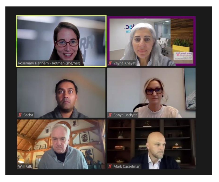
Digital Health Panel #1: Looking Ahead, what's next for digital health in Canada?